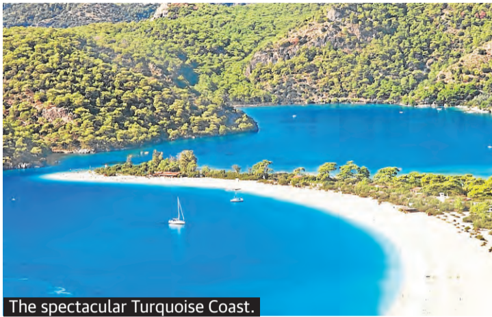
The spectacular Turquoise Coast.