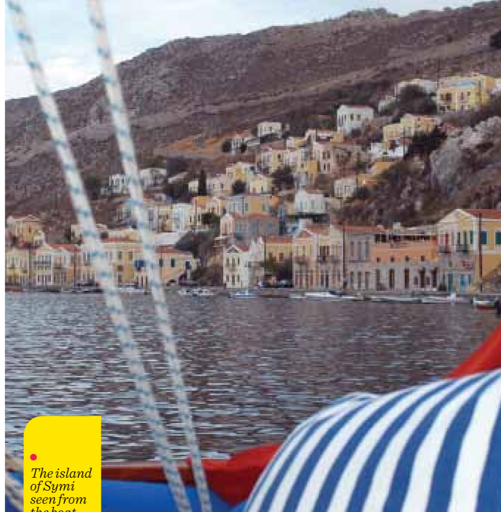
The island of Symi seen from the boat.